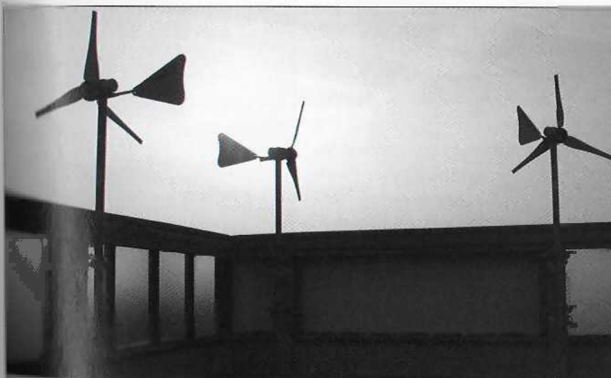
The recent installation at the CFS tower in Manchester

There are three categories that existing wind energy in buildings can broadly be