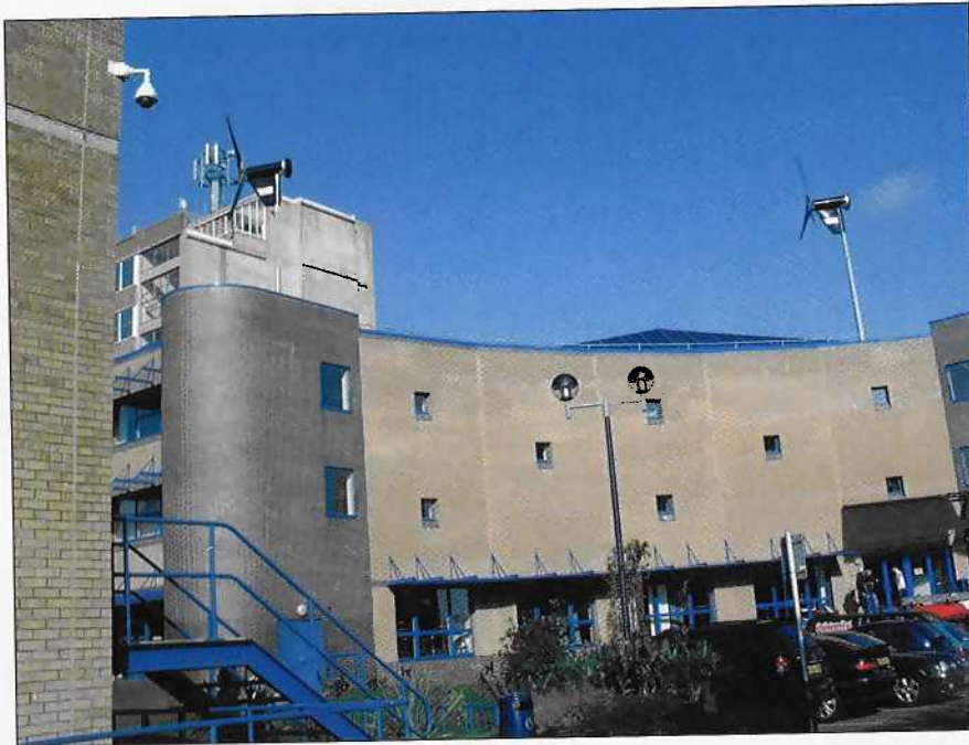
Two rooftop mounted Proven turbines

around a vertical axis which has proved to have some advantages for integration into buildings. Some examples of development of VAWTs are present in The Netherlands. For example the WindWall VAWT system has been installed on a number of sites to test its performance with the intention being that a number of these systems are aligned horizontally along a building edge forming a wall. Another Dutch company Ecofys BV has developed a series of Urban Turbines, which it claims are not sensitive to changes in the wind direction or speed. Delft Technical University is also very active in this area and has designed a roof mounted turbine, the Turby which is a Darreius type turbine with twisted axis. The Ropatec wind turbine developed in Italy is a robust VAWT that has been installed in sites all over the world. The turbines can be stand alone or mounted onto the roof of buildings and examples of both are installed in various locations across the world. In the UK two small companies have made exciting developments in this field. Winddam has developed a vertical axis turbine which makes use of the inherent strength of the building to intercept and use the wind energy. The design also uses sustainable wood laminate blades. XCO2 has developed the 6kW quietrevolution vertical axis wind turbine. This has been going through pre-production testing and the first installations are planned for early 2006. An option offered by XCO2 is