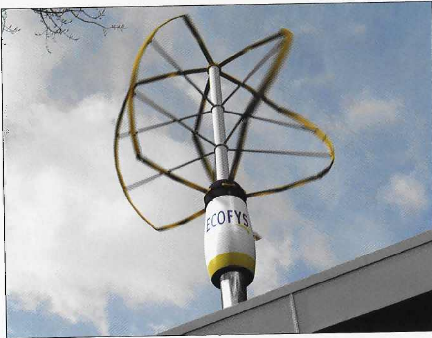
The Urban Turbine developed by Ecofys UK

particularly in low and variable winds consistent with an urban situation. Using its experience in running the Clear Skies funding programme, including the accreditation scheme for small-scale wind products and installers, BRE aims to assess a number of currently available models, and produce performance data that could ease the concerns of sceptical customers. Safety issues, namely the safe containment of any failed rotor are very important and in some cases the steps taken to deal with this are designed to visually reassure onlookers. For example the WindWall system has an outer metal casing that will contain any parts of the rotor should they become detached. Noise from turbines also needs to be considered and depending on the site that is chosen there will be more or less toleration to noise. The ideal case is always to have minimum noise from the turbine, and many designers are striving to achieve turbines that turn almost silently. This is still a very young industry and consequently money and time need to be invested in research and development of the technology. A recent UK report identified some of the main technical barriers facing the sector as the need to develop understanding of power augmentation and ducting, and the need to design for high turbulence levels 1 .